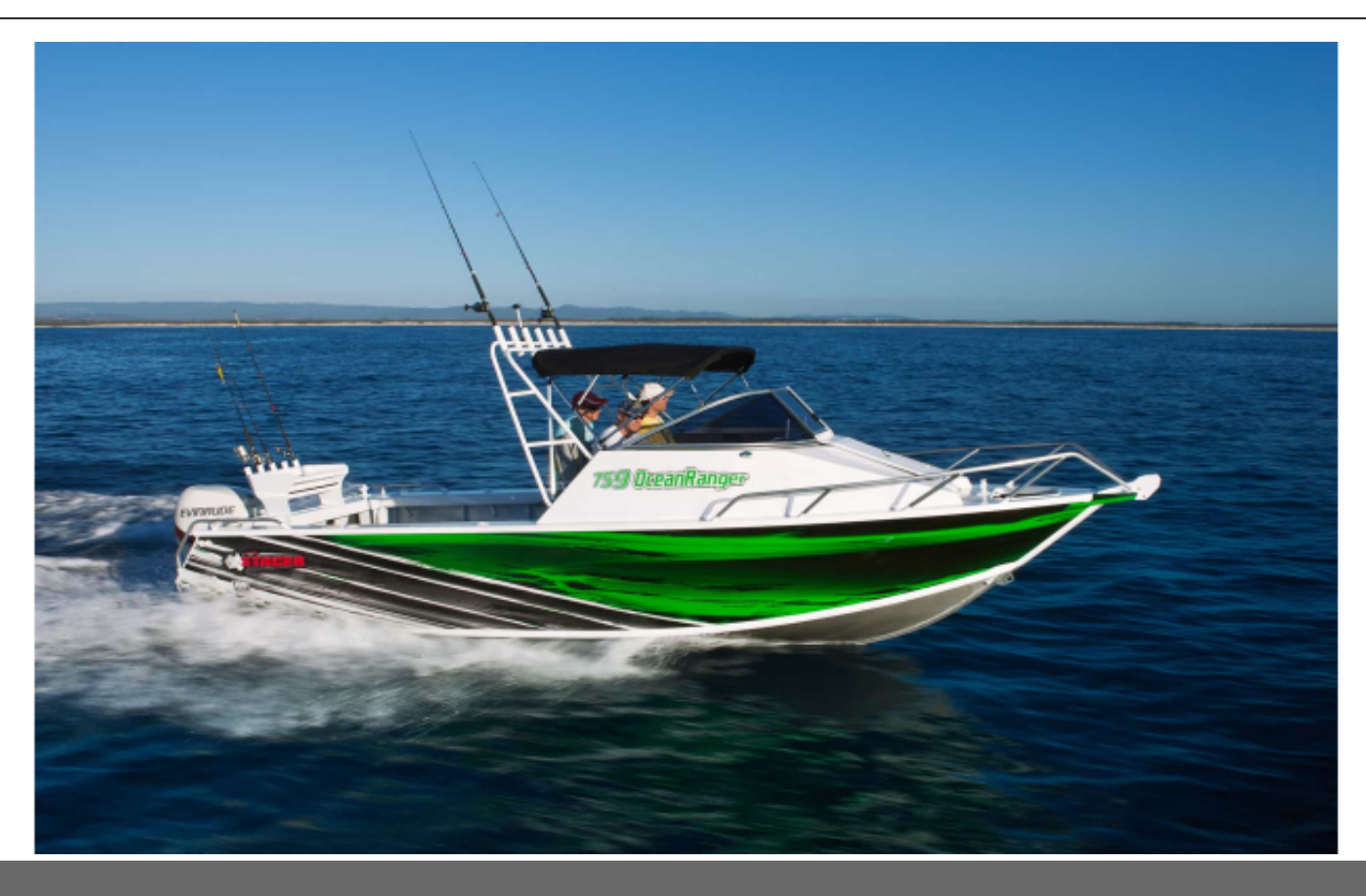
Stacer 759 Ocean Ranger