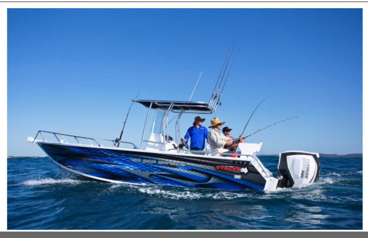
Stacer 709 Sea Ranger CC POA