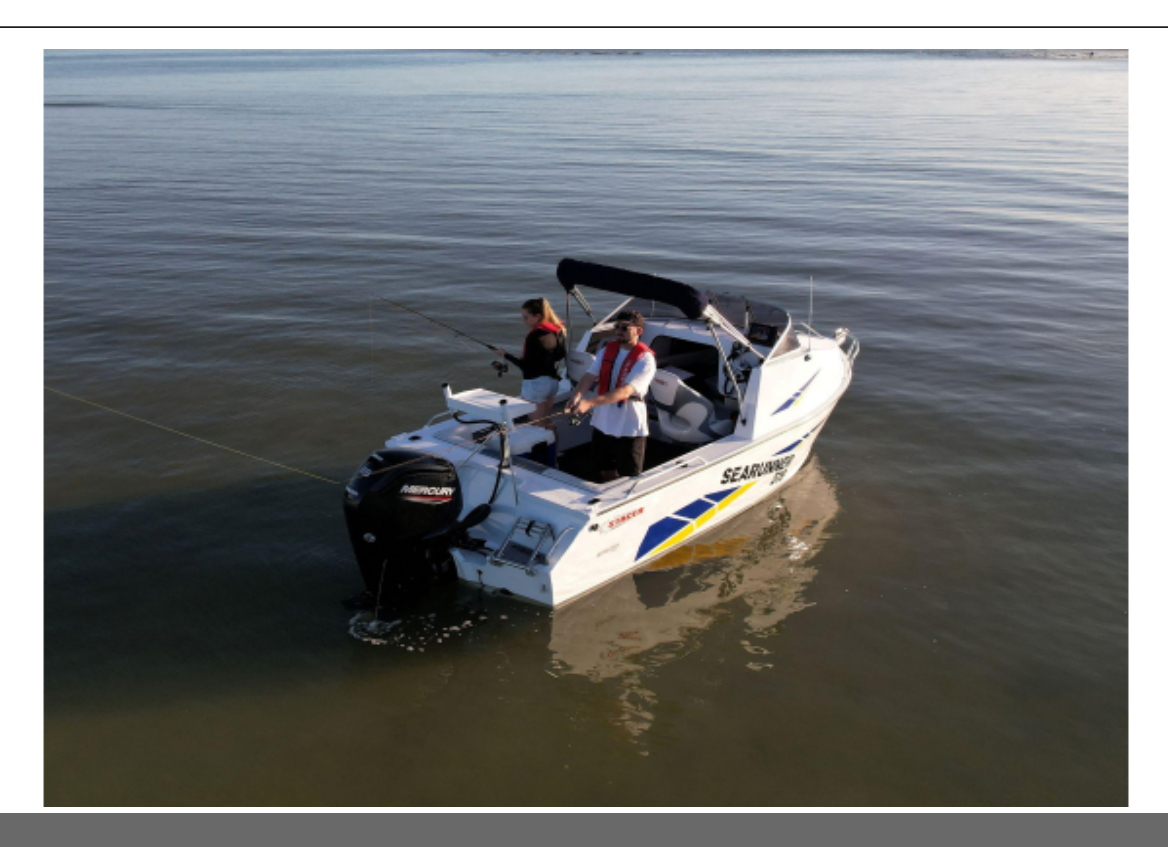
Stacer 519 Sea Runner SE POA