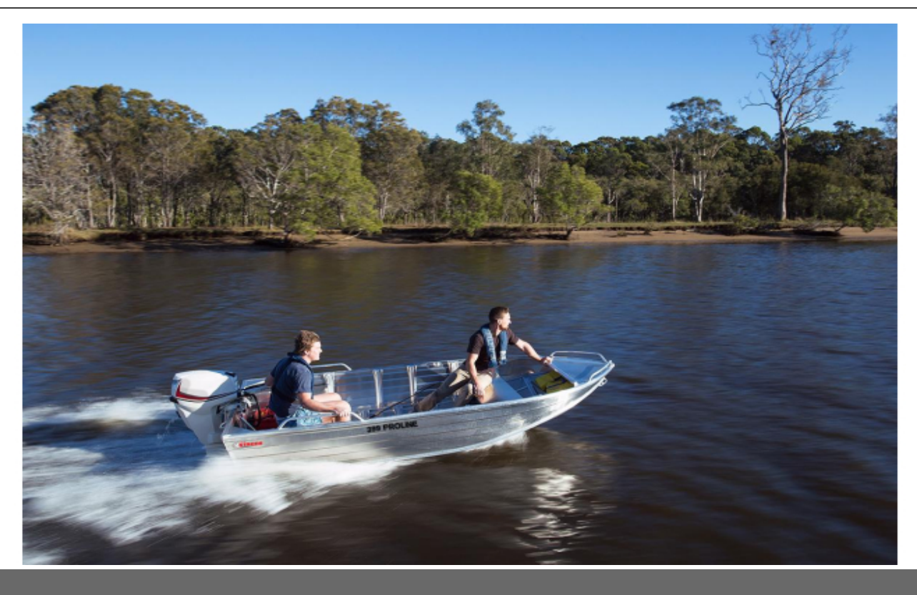
Stacer 399 Proline