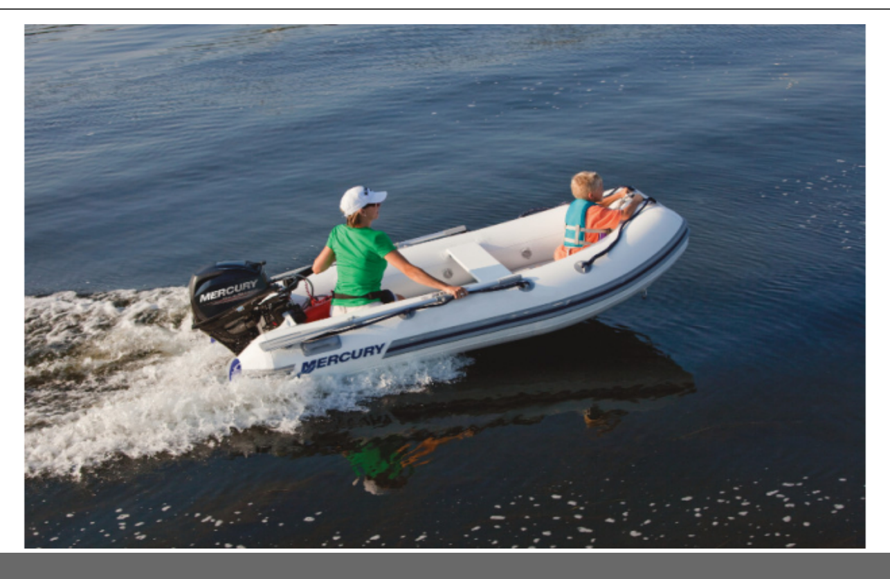
Mercury 320 Air Deck